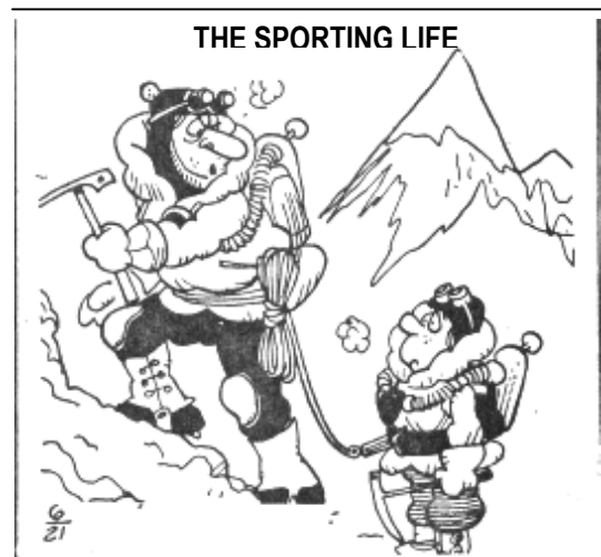
"Why didn't you think of that before we left base camp?"

Our Attempt: In order to have maximum daylight, we have always timed our efforts for the last weekend of winter. And always. we have been repulsed by storms. This year we decided in favor of early winter, hoping that the shorter days might be offset by more settled weather conditions. Thus our party, consisting of Arold Green, Mont Hubbard and myself, left the Glacier Lodge roadhead on the morning of December 30. After two days of snowshoeing in the