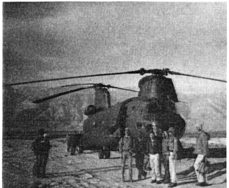
One big helicopter!

The next day we concentrated the search on the ridge north of base camp because of the tracks found in that area. Eighteen searchers were heloed to the top of the ridge in a single load by a CH-47 from the Stockton National Guard. From the top the searchers fanned out covering the drainages leading down to the valley floor and line-searched the southeast face lead-