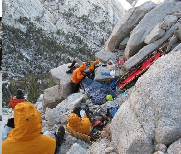
Operation 2011-15: Waiting for the helo