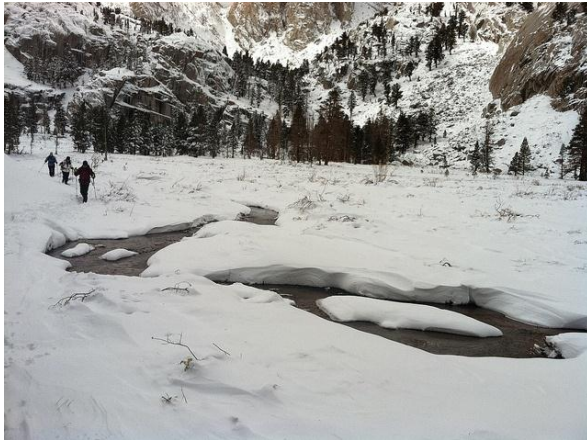
Operation 2011-14: Snow at Outpost Camp