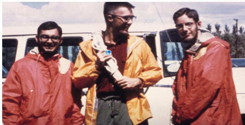
1967 CLMRG McKinley Expedition