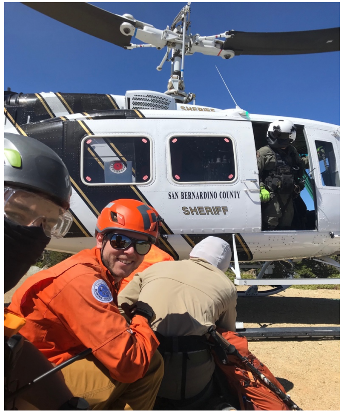
Prior to helicopter departure from the summit.