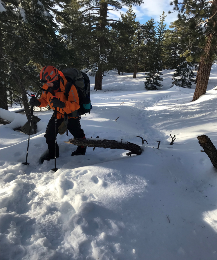
Hours = 60 hrs Mileage W2905 = 358 San Jacinto wilderness Riverside County =====

weight and unable to climb back up to the trail and the conditions also prevented her partner from getting down to her. When the Subjects called for emergency assistance, the winds aloft had prevented any possibility of helicopter extraction, fortunately she did have large rocks at her location that provide a partial shelter.