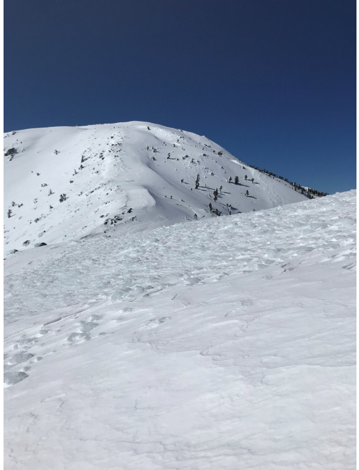
Mt. Harwood, Devils Backbone - San Bernardino Co. Ice covered slopes approaching Mt. Baldy