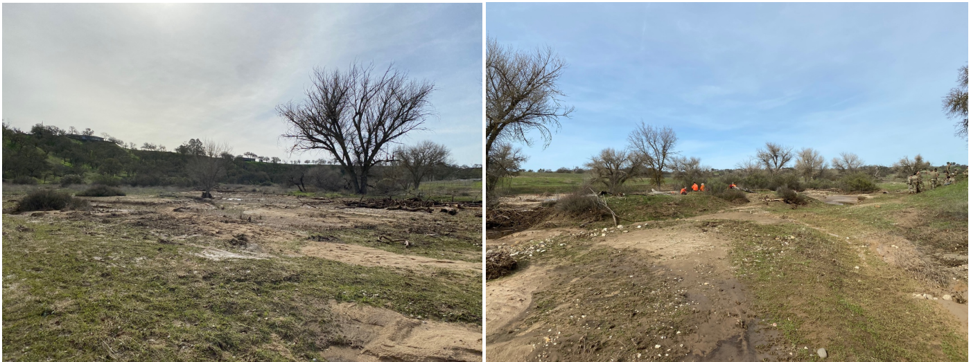
Flood plain of San Marcos Creek, normally dry; piles of debris to be searched