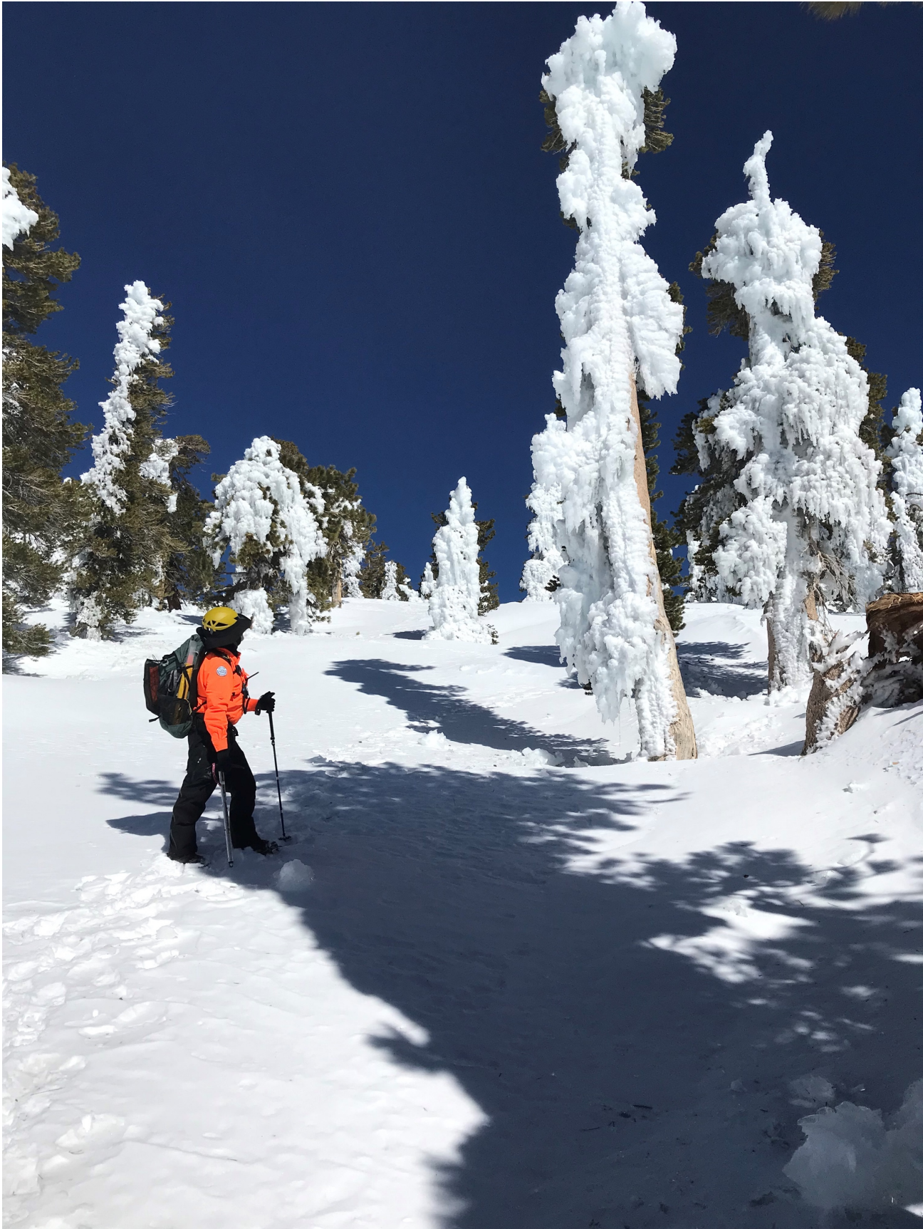
Upper slopes near Mount Harwood – San Bernardino County