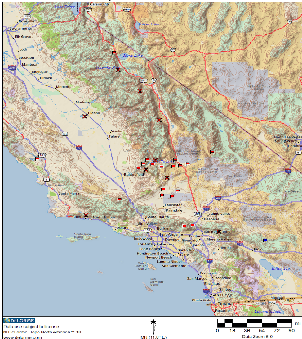
Map of Mission Locations

Below is a map with approximate locations of Operations for the year (X's denote non-fielded mobilizations, alerts, or transits).